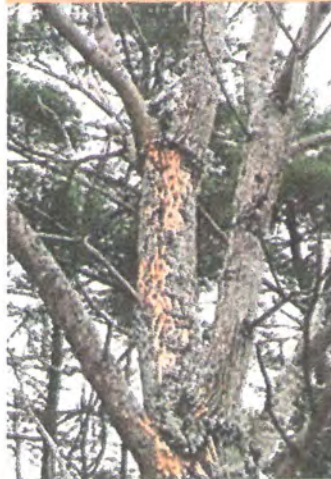
Learn about EAB at http://bit.ly/2GX98nG